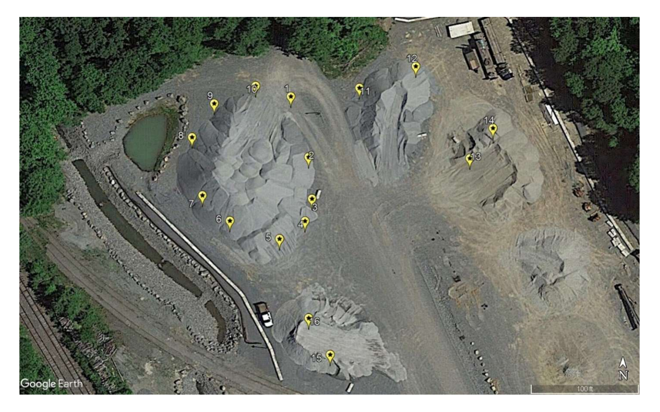
Figure 1. Map showing the locations of the stockpile samples collected at the Rock Hill Quarry. The latitude and longitude for each sample location is shown in Table 2.