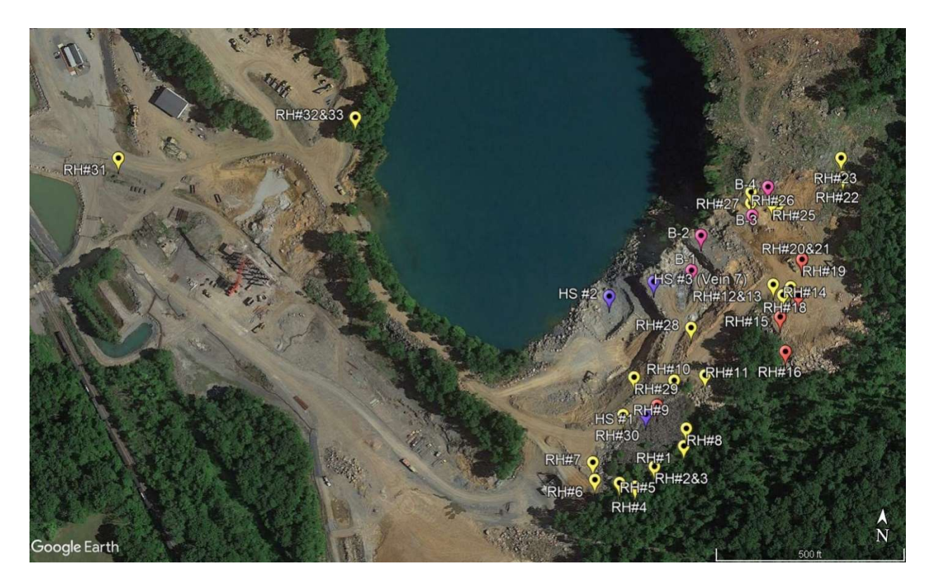
Figure 2. Map showing the locations of the boulder, dill core, and hand samples collected at the Rock Hill Quarry. The latitude and longitude for each sample location is shown in Table 2.