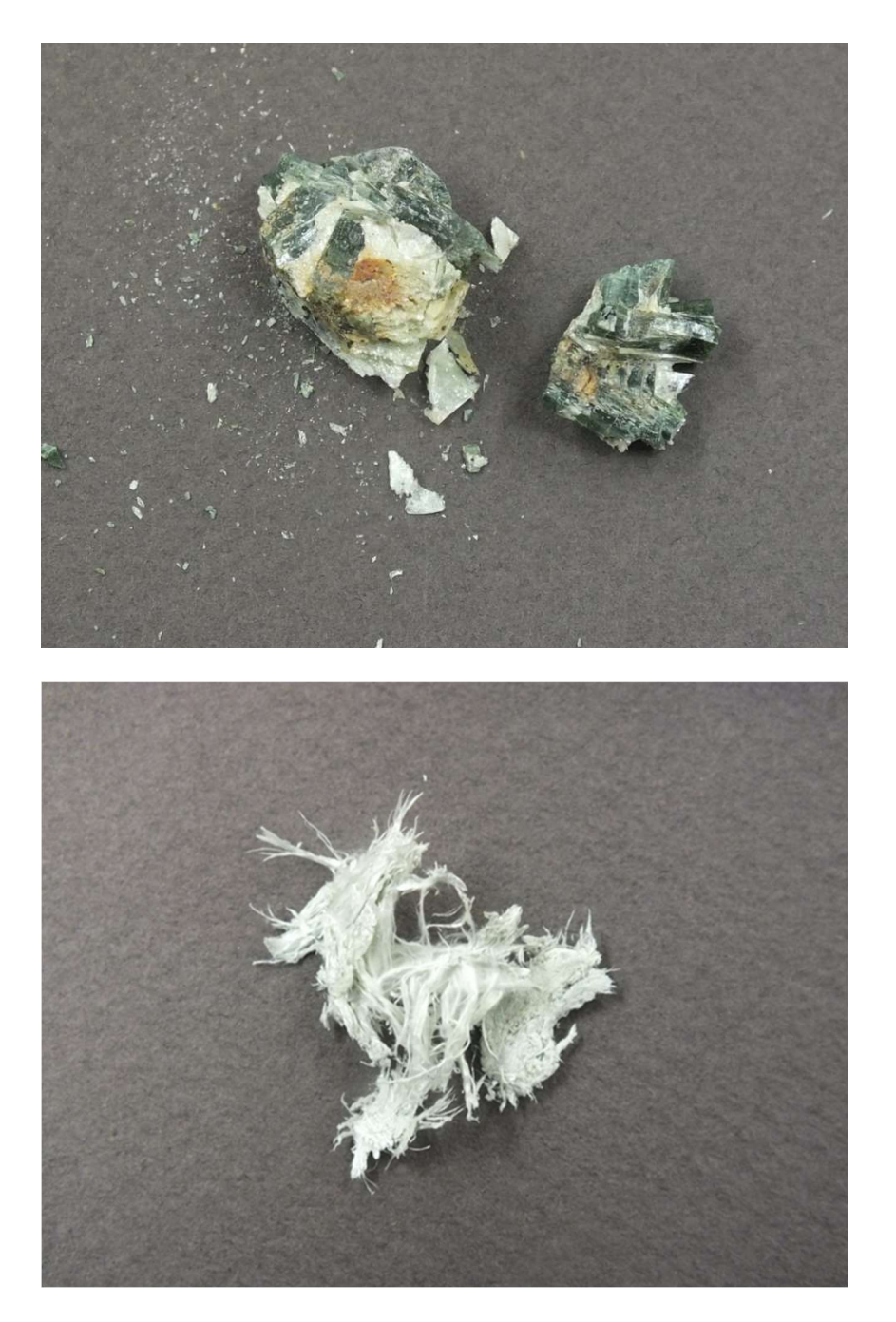
Figure 4. Photographs of non-asbestos actinolite (top, San Bernardino CA) and actinolite asbestos (bottom, HSE reference material). The asbestos appears cotton-like while the non-asbestos has a blocky appearance.