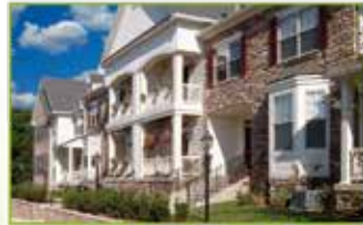
Heritage Greene • Sellersville