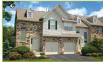
Heritage Summer Hill • Doylestown