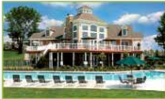
Heritage Orchard Hill - Clubhouse • Perkasie