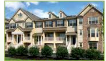
Heritage Pointe • Chalfont