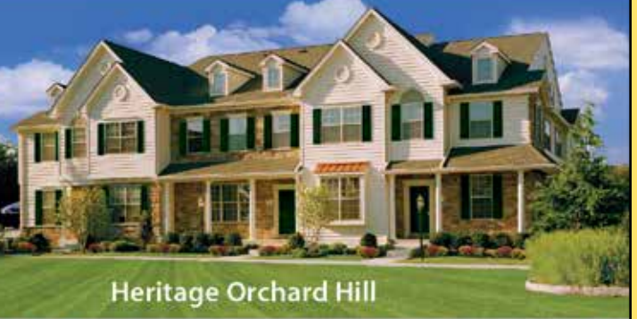
Heritage Orchard Hill